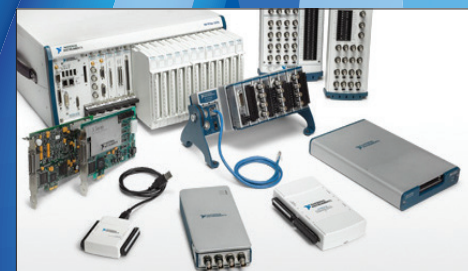
Interfaces with Multiple Manufacturers

www.Scadata.net Call Toll Free at 866.623.0525